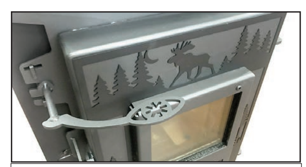
The bypass lever interlocks with the door when the combustor is engaged (bypass closed). This safety feature makes it impossible to open the loading door without opening the bypass.