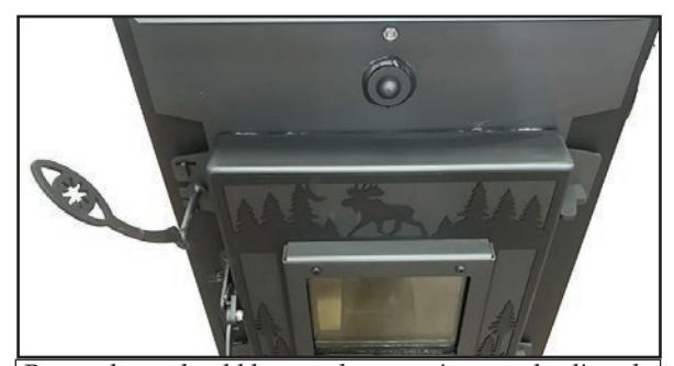
Bypass lever should be up when starting or reloading the Survival Hybrid, allowing the smoke to heat up to 500° internally, or 200°-250° on the surface.

You can also obtain a lot of useful information by visiting our website (www.woodstove.com). Other very useful web sites on all aspects of wood burning are (www.woodheat.org) and (www.csia.org). CSIA is the Chimney Safety Institute of America