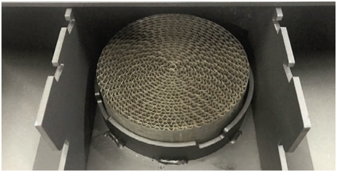
Remove the shield to access the catalytic combustor for removal.