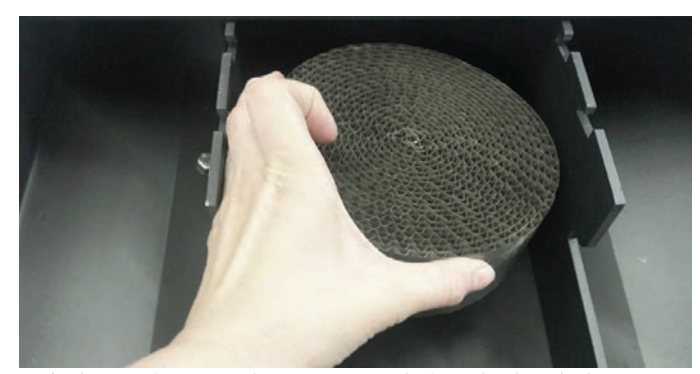
Lift the catalytic combustor out and clean both side (see instructions to the left).